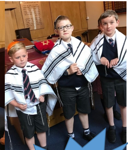
Wearing Tallits and Kippahs.