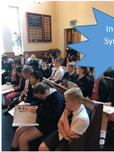
Inside the Synagogue

On Monday 3 rd and Tuesday 4 th June, Year 4 visited the Orthodox Synagogue in Solihull. We were given a general introduction to the Synagogue and Jewish traditions; an explanation of the various religious items within the synagogue as well as a look inside the Ark and the opportunity to see a real handwritten Torah scroll up close.